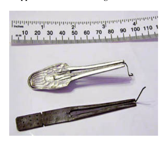
Pat Chapplle Collection - Tuvan Khomuses